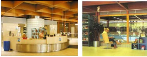
Common foyer/reception desk,

Library – swimming bath / Community Centre